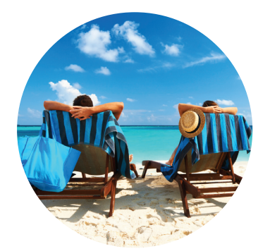
Temkins on Beach

make its prediction? DAMN you Florida!!!